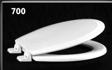
Luxury molded wood seat with Centoco's patented polypropylene shell for round bowl.