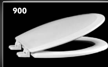
Luxury molded wood seat with Centoco's patented polypropylene shell for elongated bowl.