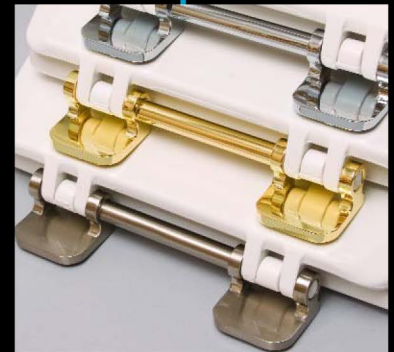
Hinge and post available in Chrome, Brass and Brushed Nickel.

Molded bumpers and heavy-duty, impact-absorbing hinges won't loosen, collect dirt or fall off.