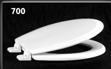
700 Luxury molded wood seat with Centoco's patented polypropylene shell for round bowl.